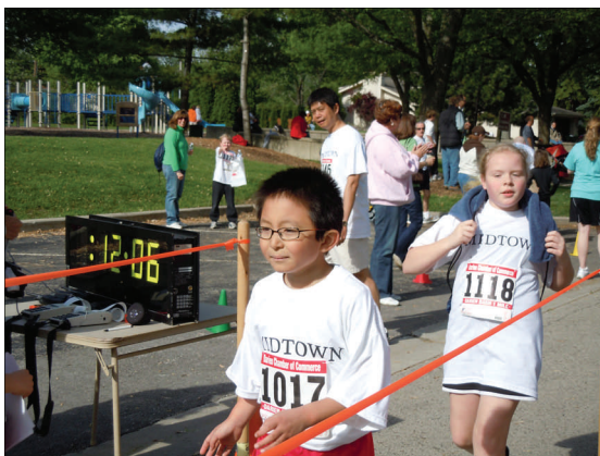
The Finish Line